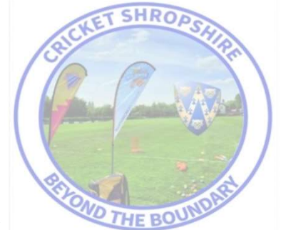
Beyond the Boundary