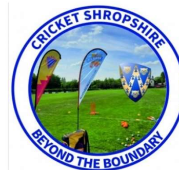
Beyond the Boundary