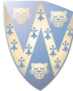
Cricket Shropshire Coaching