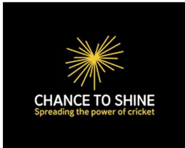
Chance to Shine