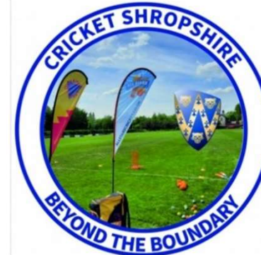
Beyond the Boundary