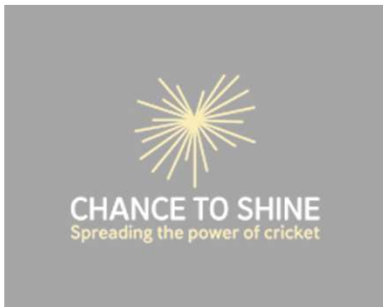
Chance to Shine