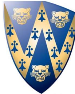
Cricket Shropshire Coaching