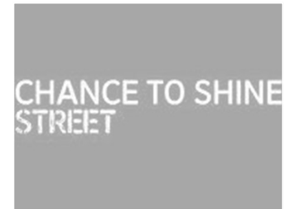
Chance to Shine Street