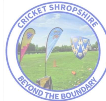
Beyond the Boundary