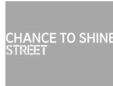
Chance to Shine Street