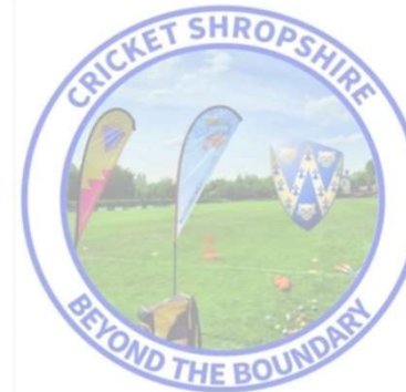
Beyond the Boundary