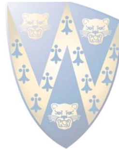
Cricket Shropshire Coaching