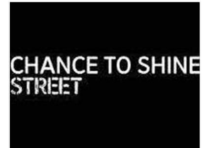
Chance to Shine Street

ECB Accredited, Specialist, Experienced Coaches